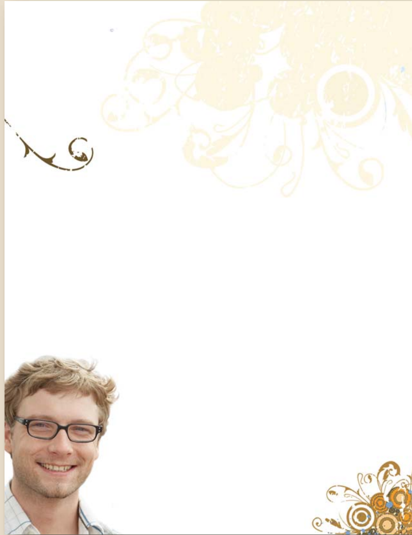
Poster (any size) & Table Topper