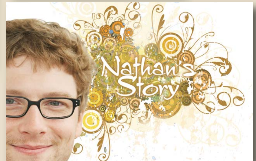
Direct Mail Postcard