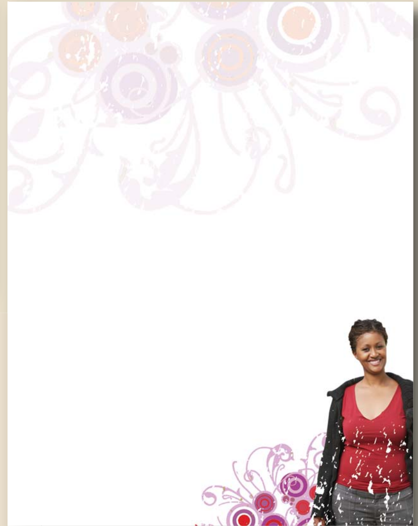
Poster (any size) & Table Topper