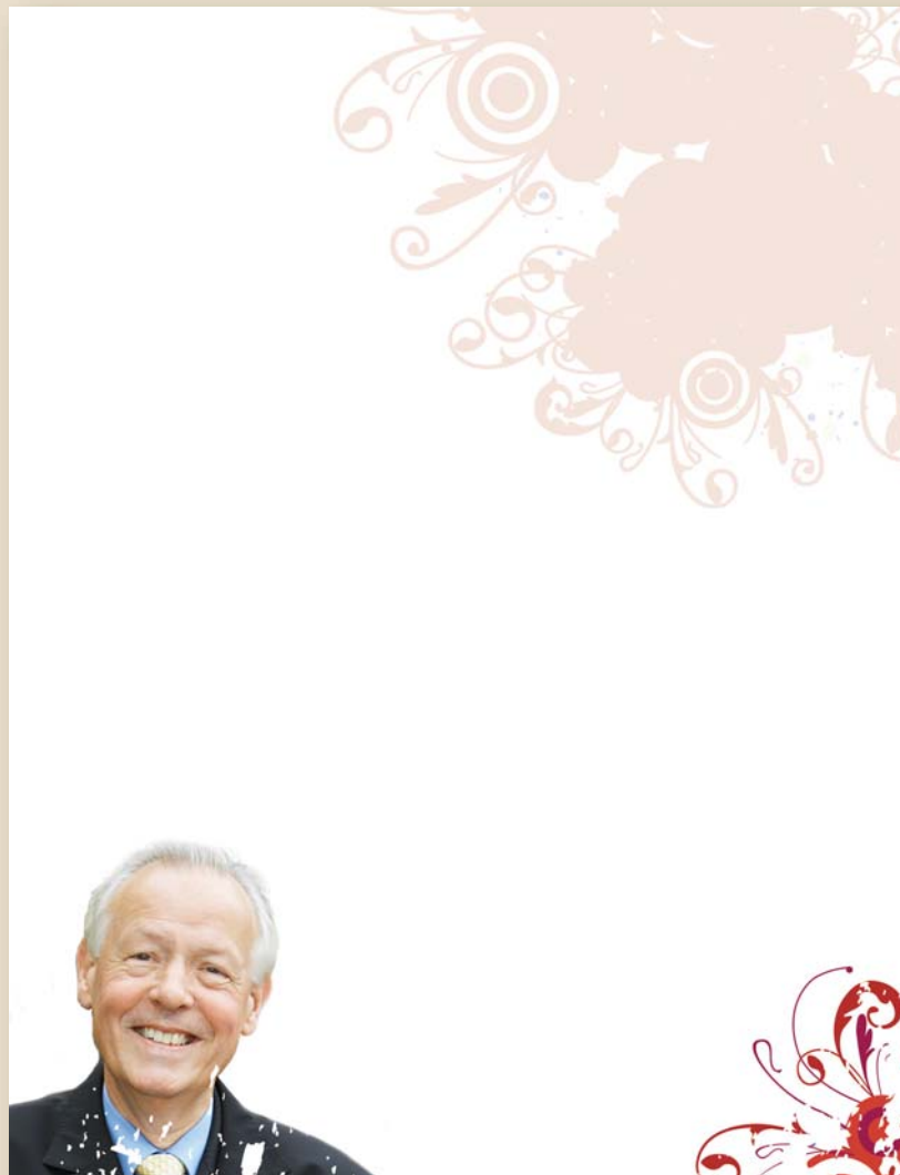
Poster (any size) & Table Topper