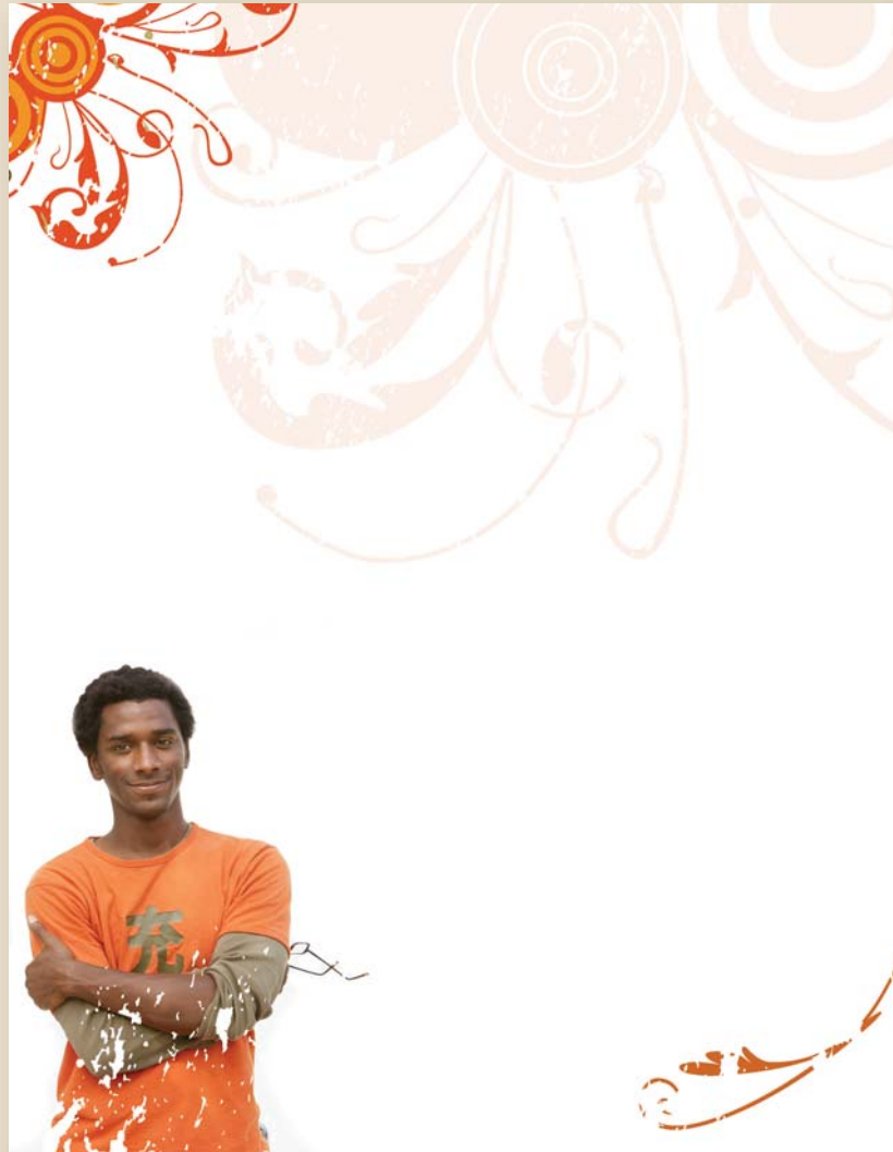
Poster (any size) & Table Topper